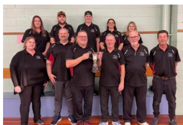
ZONE 1 WINNERS - COUNTIES