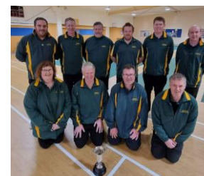
ZONE 5 WINNERS - ASHBURTON