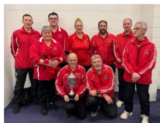
ZONE 4 WINNERS - HUTT VALLEY