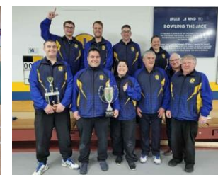
ZONE 6 WINNERS - OTAGO